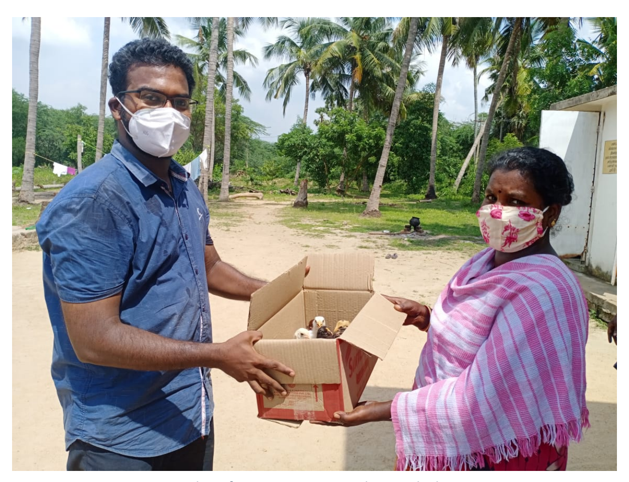
A beneficiary receiving Aseel-cross chicks

As part of our mission to enhance rural livelihoods, Thondaimandalam Foundation funded the provision of 180 one-month old Aseel-cross chicks to 12 households across 6 wards in Pandeswaram village, Thiruvallur District on 29<sup>th</sup> August, 2020. The total cost of procurement and distribution of the chicks amounted to Rs.18,000. The native country chickens will be maintained by the beneficiaries, and the country eggs produced by the chickens will be bought back by the Village Panchayat. We believe that this program will help as an additional source of income to the economically marginalized households.